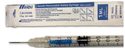
Figure 1. Blue needle hub retracts into syringe barrel when the plunger is fully depressed during use.